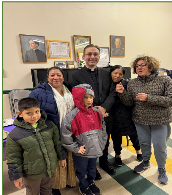
Fellowship with perishoners.

Holy Eucharist lasts 15 minutes, Matrimony lasts until the death of a spouse, Anointing of the sick lasts until death or the recovery from an illness, Reconciliation until another mortal sin is committed. So, we are most closely united to Jesus through the sacrament of the Holy Eucharist. Our blessed mother had a profound sacrificial love for God. The 7 sorrows of Mary are a window in sharing of her suffering. We should strive to live life like the Virgin Mary so we can progress to holiness.