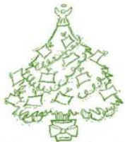
Christmas Giving Tree

Please take an ornament from our Giving Tree to help a child in need. If you would prefer to give a monetary donation, please take an envelope from the basket and enclose a check written payable to SPSJ with Giving Tree in the memo section. You may place the envelopes in the collection basket or return them to the church office. There are also two boxes with tags for nursing home residents. One box is for male residents and the other for female. All gifts are to be returned, with the tag attached, the weekend of December 15/16 th . Please return the gifts unwrapped. Parents will be picking up the gifts by December 17 th , so our return date is important. Thank you in advance for your kindness and generosity.