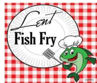
table service or take-out from 4pm to 7pm in Mercy Hall. The cost is $12/adult & $6/child. Pizza will be available for $3/slice. Place your order before going into church and we'll have your meal waiting for you after Stations of the Cross. *All proceeds of the February dinner directly benefit the Mercy Hall boiler replacement.

The Knights of Columbus Council #474 will be having our annual Lenten Fish Dinners on February 20 th *, March 6 th , 20 th and 27 th . Dinner will include: fish, fries, mac & cheese, coleslaw, & dessert for