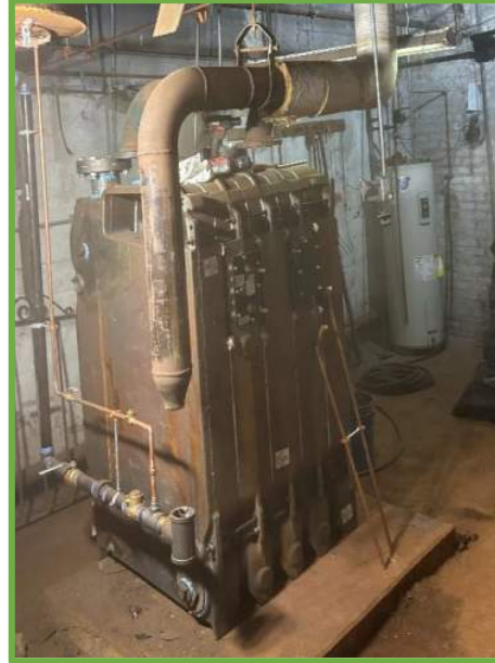
Installation of new boiler