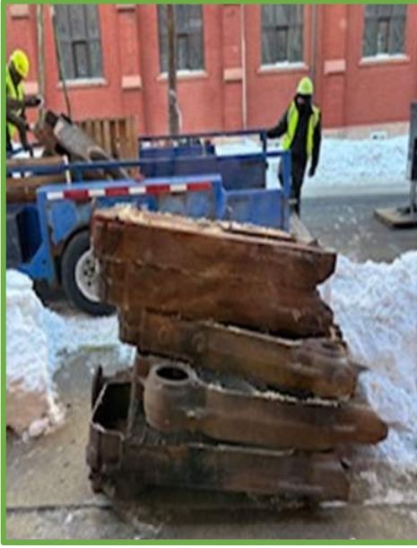
Removal of old boiler

(In the near future an announcement will be made on completion.)