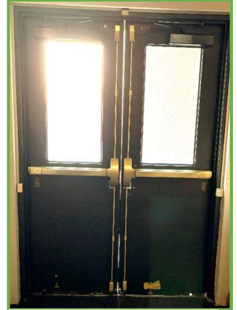
Updated hardware on the church doors